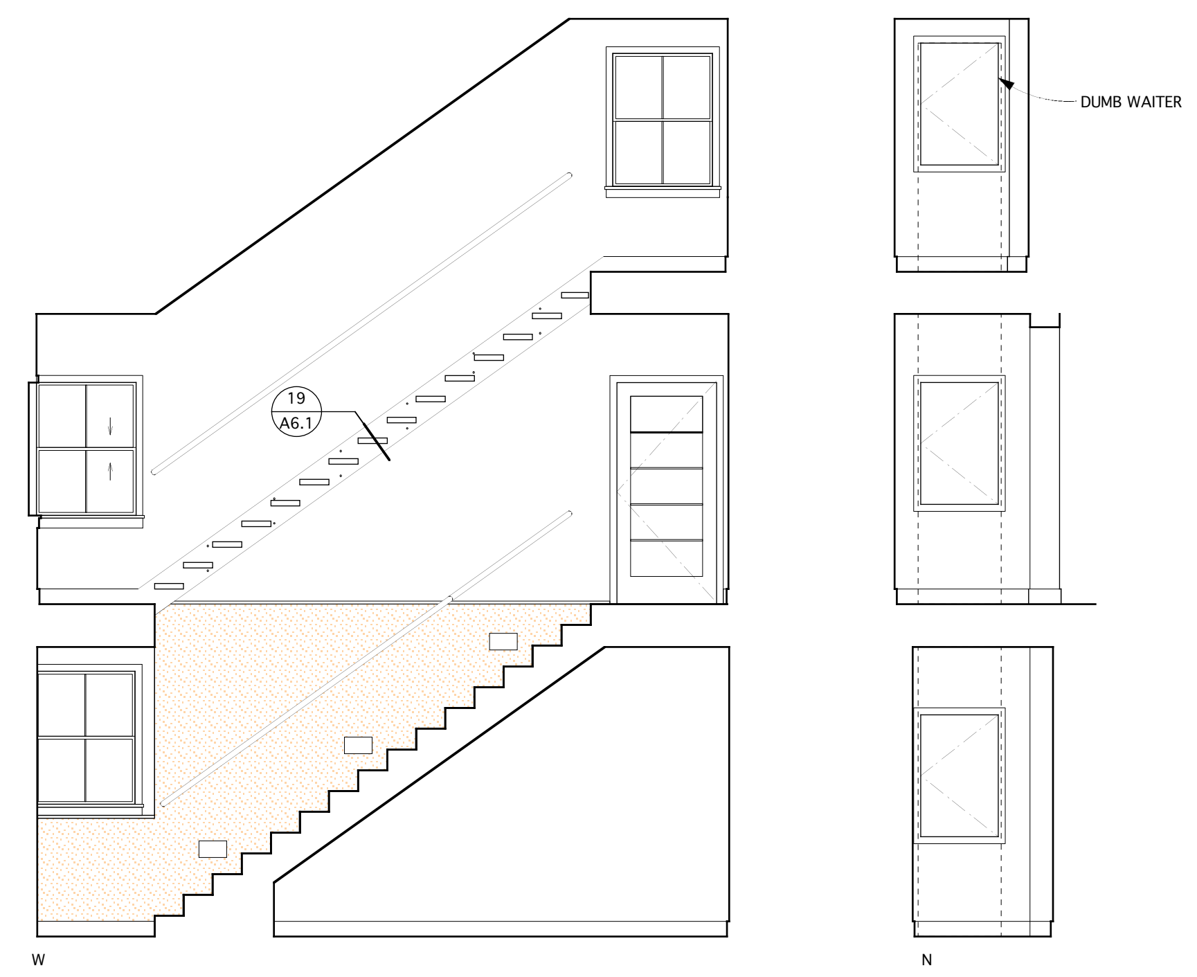
5 STAIRS A5.1 SCALE: 1/4" = 1'-0"